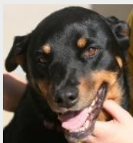
Sage Rott X 7 Years Old S. Female

I am a lovely calmer girl that just wants some love. I get along with other animals, kids, and anyone else I come in contact with!