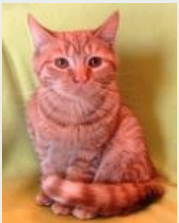
Morris DSH 9 Months N. Male

I am a lovely calmer girl that just wants some love. I get along with other animals, kids, and anyone else I come in contact with!