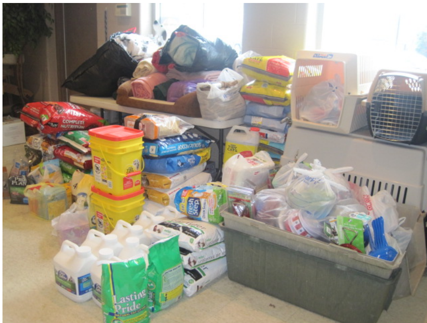
Some of the donations collected during the donation drive to help tornado victims in Washington County.

I'm just a southern belle looking to relocate. Contrary to what many think, older ladies make a fine companion. I reckon you will just have to give me a try so I can show ya.