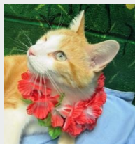
Dreamsicle DSH Neutered Male 2 Years Old

I'm an awesome girl. I love shopping, cuddling, and playing. I'm rather fit and would love to have a companion that is active as well. Come see me, you won't be disappointed.