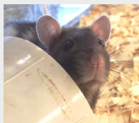
Lilly Rose Rat Female 1.5 Years

I am a sweet girl who loves to snuggle on shoulders, roll around in my giant exercise ball, and just relax. My adoption fee is $10 and I come with a small cage.