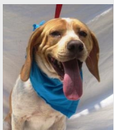
Webster Beagle 2.5 Years N. Male

I am a well educated fellow, well versed in play and manners. Visit me at the shelter and let me stimulate your mind and soul!