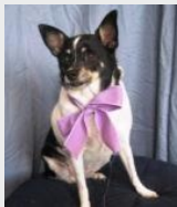
Holly Chihuahua X S. Female 6 Years Old

I may be a little bit older but I still have a little skip in my step. I get along with others as long as they aren't invading on my cuddle and toy time!