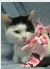
Poppers DSH S. Female 1 Year Old

I may be a little bit older but I still have a little skip in my step. I get along with others as long as they aren't invading on my cuddle and toy time!