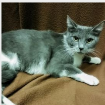
Kitty Perry DSH 10 Months S. Female

I may be a little older but have just as much life left in me as all those youngins around me! Visit me today, I'll show you love!