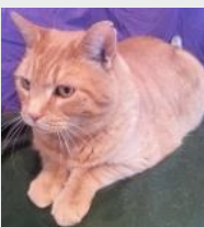
Blain DSH 2 Years Old N. Male

I am 82lbs of pure fun and love. The beginning of my life was rather tough. Please show me what real love is all about!