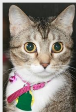
Mari DSH 2 years old Female

I am an active little girl who loves children and other animals. I still need a little work on some training but with a little work, I'll be there.