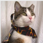
Vinnie DSH 2 years old N. Male

I am a very sweet little girl who is incredibly affectionate. I just need someone to show me love and bring me into their family.