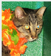
Bub DSH 3 years old Neutered Male

I am an older lad that just wants a home. Just because I am older doesn't mean I am boring. I am full of energy and spunk still! If I am going to have siblings, its best that I meet them first.