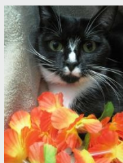
Mia 1.5 years old DSH Spayed Female

For an older gentlemen, I still have a decent amount of energy. I love to play and exercise. I do well with others. If you are interested in a fun loving older guy, I'm your man.