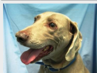
Ross 7 years old Weimaraner Neutered Male

For an older gentlemen, I still have a decent amount of energy. I love to play and exercise. I do well with others. If you are interested in a fun loving older guy, I'm your man.