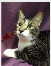
Boots 2 Years Old DSH

I am an adorable young lady looking for her soul mate. I am always happy and looking to cheer someone up. Let me put a smile on your face!