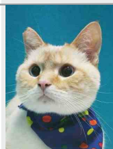
Edgar DSH 5 Years Old N. Male

I am just your average good looking guy looking for a new home to call mine. I am pretty tolerable with most things, but I am not a big fan of dogs. Visit me at the Feeders Supply on Grantline Road!