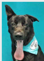
Zorro Lab X 3 Years Old N. Male

I am just your average good looking guy looking for a new home to call mine. I am pretty tolerable with most things, but I am not a big fan of dogs. Visit me at the Feeders Supply on Grantline Road!