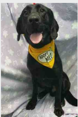
Lenny Lab X 3 Years Old N. Male

Seeking a gentle and loving hand to call my own. I am an absolute lover, even to other cats. Dogs on the other hand, not so much. Please visit me today!