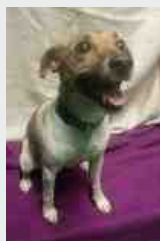
Chili Jack Russell X 2 Years Old N. Male

I am pretty laid back lady, who does love the camera. I am rather affectionate, too. Please come see me today; I want some lovins!