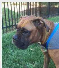
Poppy Boxer 2 Years Old S. Female

Poppy is an incredibly sweet girl that came to the Shelter as a stray. Our vet quickly found out that she had a severely broken lower jaw. We reached out to The ArrowFund for assistance, and they did not hesitate to take her and help her recover. Her jaw was partially amputated. They also found and removed cancerous tumors as well. This poor girl has had a rough start to life. She may not do well with other dogs, but she has the heart of 100 dogs! Her adoption will go through the ArrowFund, but she can be visited here at the Shelter.