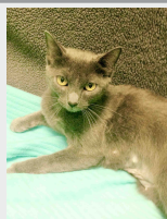
Henrietta DSH S. Female 2.5 years old

I am a sweet girl, but I don't like when other cats get in my space. I also like some outside time. I'll dart out to get it if needed! Visit me at the Shelter today - I have been here so long!