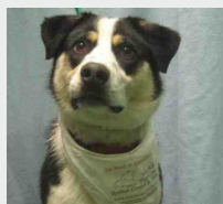
Gus Hound X N. Male 2 years

I am a sweet girl, but I don't like when other cats get in my space. I also like some outside time. I'll dart out to get it if needed! Visit me at the Shelter today - I have been here so long!